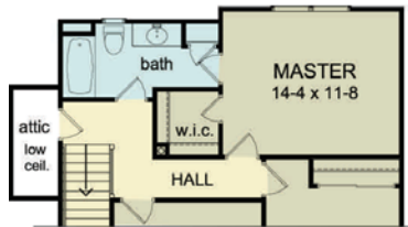
ALT. BATH LAYOUT