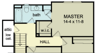
ALT. BATH LAYOUT